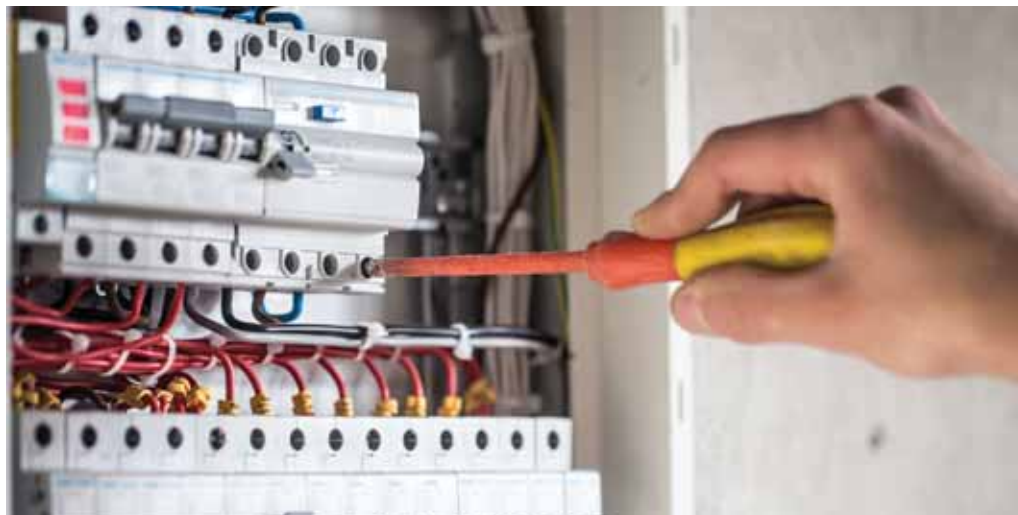
Upgrades and repairs to electricals of Buildings A & B done in 2020

I wish to extend special thanks to my fellow committee members for their pro-bono services and assistance with regards to site visits and reports, draft specifications and evaluation of material costs submitted by providers for works to be undertaken by the IM Committee.