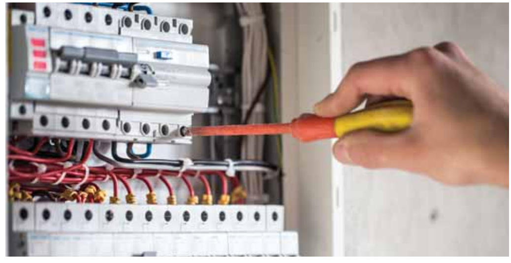
Upgrades and repairs to electricals of Buildings A & B done in 2020

I wish to extend special thanks to my fellow committee members for their pro-bono services and assistance with regards to site visits and reports, draft specifications and evaluation of material costs submitted by providers for works to be undertaken by the IM Committee.